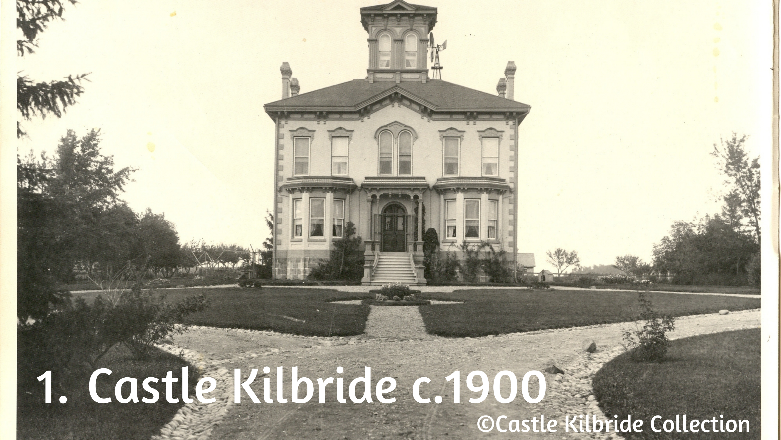
1. Castle Kilbride c.1900