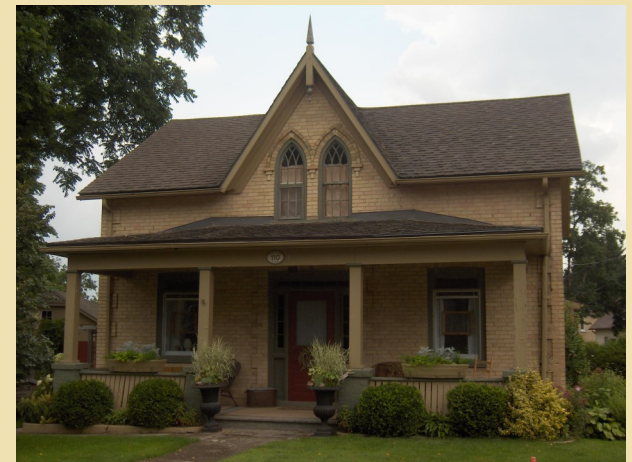
Pinchenant/ Bender House c.1869 Non-designated site