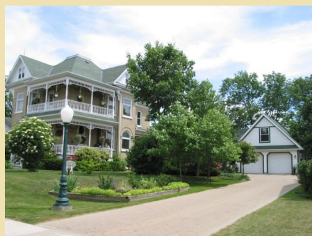
Hunsberger/ Miller House c.1910 Non-designated site

The purpose of the Heritage Wilmot Advisory Committee is to advise and assist Council and staff of The Township of Wilmot on any matter relating to the designation and conservation of property of cultural heritage value or interest, and to promote heritage interests and to assist with the recognition of the historical continuity within the community.