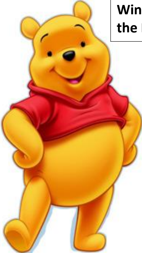
Winnie the Pooh